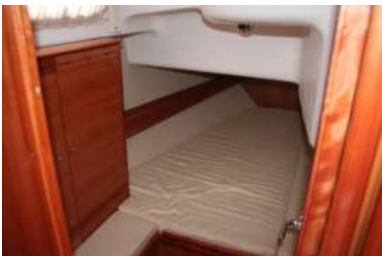
Starboard Aft Cabin