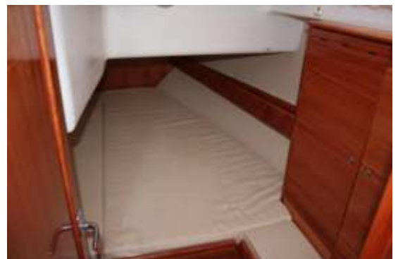
Port Aft Cabin

Contact: Clipper Marine Hamble Email: brokerage@clippermarine.co.uk Fax: ++44(0)2380 605068