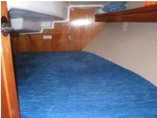
Starboard Aft Cabin